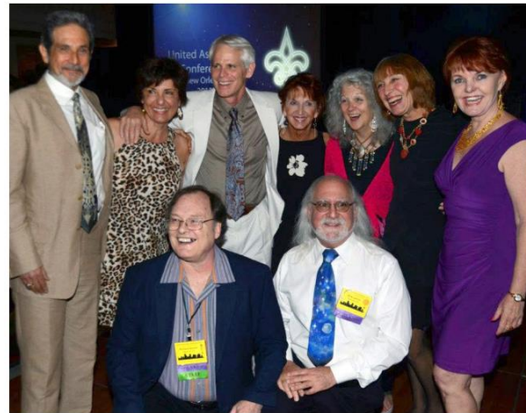
The 49ers at 2012 UAC New Orleans (Well known Astrologers born in 1949)

Love the work and be willing to work—to dive into material that is often overwhelming and confusing. Shake it up, and study with different teachers who have different methods. Don't decide on just one system—not when you are starting. Try many things.